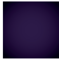
Plum C:89 M:96 Y:39 K:41