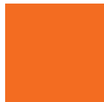
Wold Orange C:0 M:71 Y:100 K:0