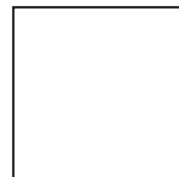
White C:0 M:0 Y:0 K:0

* Please Note: The colour swatches above are not actual paint colours, these are a rough guide to give you an idea. We do our best to replicate these colours at all times.