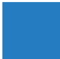
Cornflower Blue C:80 M:45 Y:0 K:0