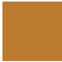
Copper C:23 M:55 Y:95 K:6