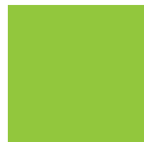
Lime C:48 M:0 Y:100 K:0